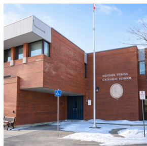
Former Mother Teresa School