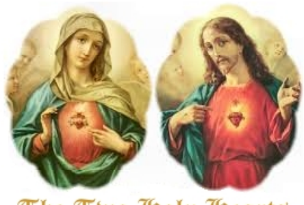
The Two Holy Hearts

Sacred Heart of Jesus and Immaculate Heart of Mary, / I consecrate my entire self to the Most Holy Love of Your Two Hearts. / I wish to make